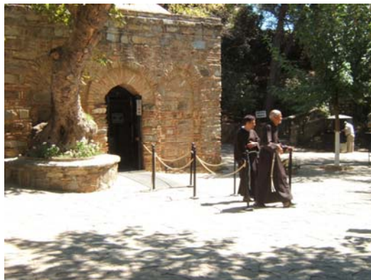
Following this we continue to Virgin Mary's House

In the afternoon we visit a leather outlet with a fashion show. Dinner and overnight: Tatlis Hotel Kusadasi.