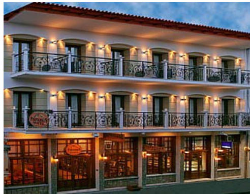
The PARNASSOS Hotel